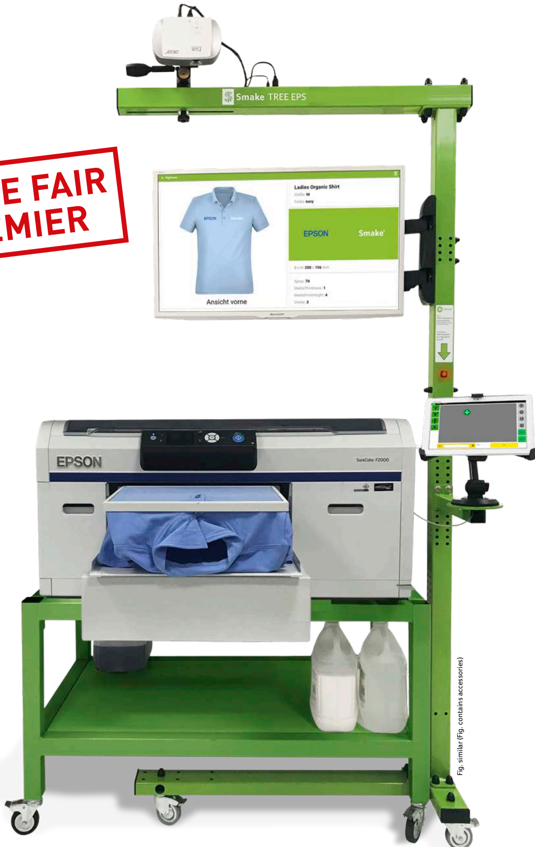
Fig. similar (Fig. contains accessories)

Optimized for EPSON ® direct to garment printers